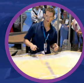
Experienced Technical Support